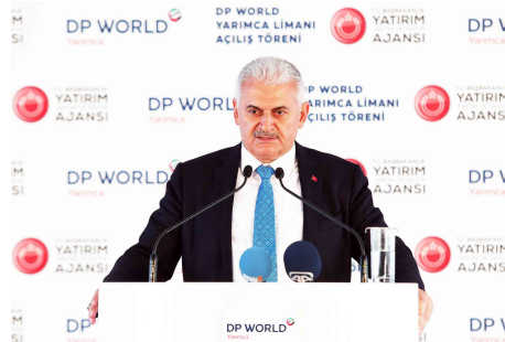
Prime Minister Binali YILDIRIM

Assisted by ISPAT at every stage of the investment process by coordinating more than 20 stakeholders, DP World Yarimca Terminal will employ 650 people to reach a handling capacity of 1.3 million TEU, which is currently more than 10 percent of Turkey's total capacity. The terminal is the first in Turkey to use remote-controlled gantry cranes with automated gate operations and fast scanner x-ray machines that can scan two containers every minute.